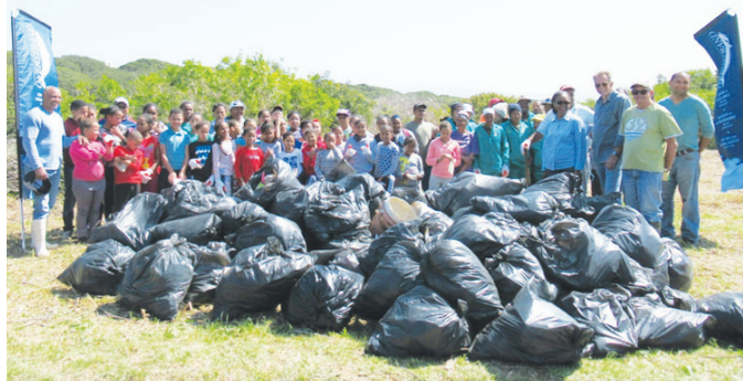
Kothulelwa umnqwazi ngokukodwa bonke abo bancedisileyo ukususa nya ePaddavlei nakwiindawo ezijikelezwe ziinduli ngeenduli zenkunkuma

Nakuba kunjalo, uNjokwana nabququzeli abangoogxa bakhe babengawuvuli umlomo bencoma ukuzimisela nenkuthalo yabo kwakunye nempumelelo yephulo lokucoca.